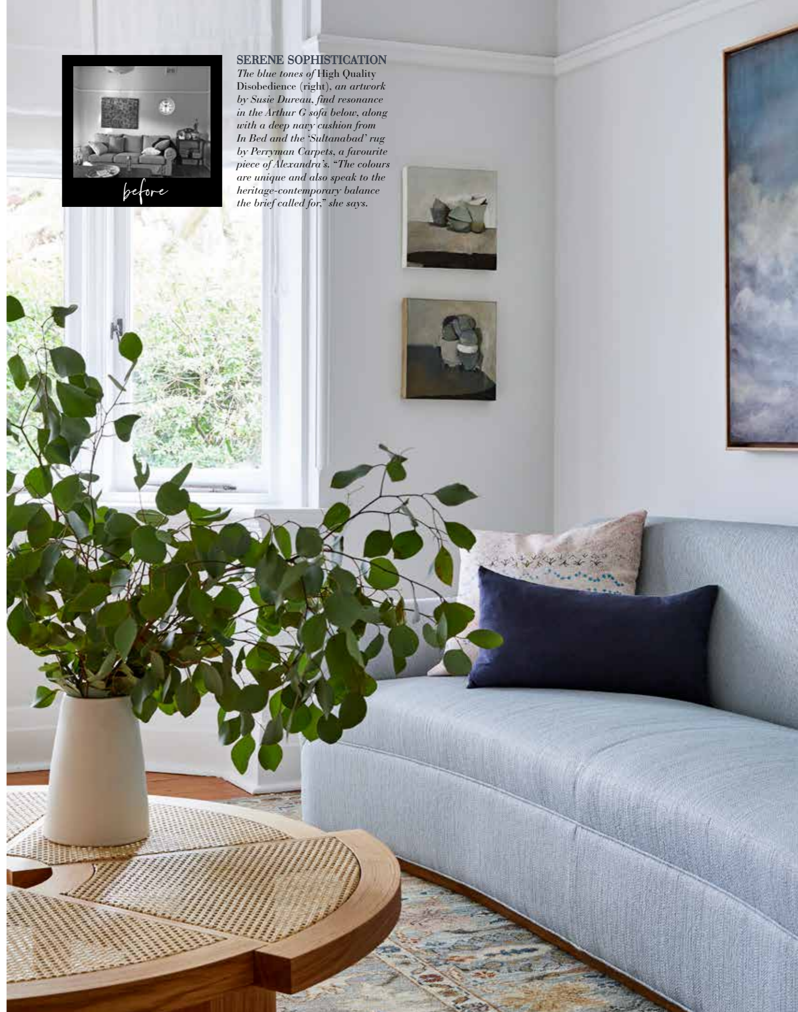
PAIR OF ARTWORKS NEAR WINDOW (OPPOSITE), ARTIST UNKNOWN